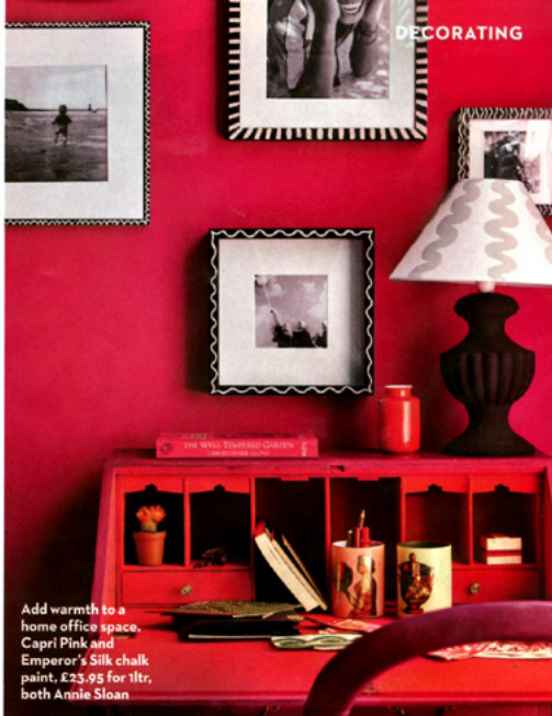
Add warmth to a home office space. Capri Pink and Emperor's Silk chalk paint, £23.95 for 1ltr, both Annie Sloan