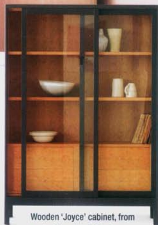
Wooden 'Joyce' cabinet, from a selection, Pinch Design