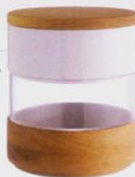
'Tre' container, £18, Habitat