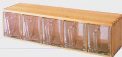
'Forhoja' shelf with glass drawers, £28.99, Ikea